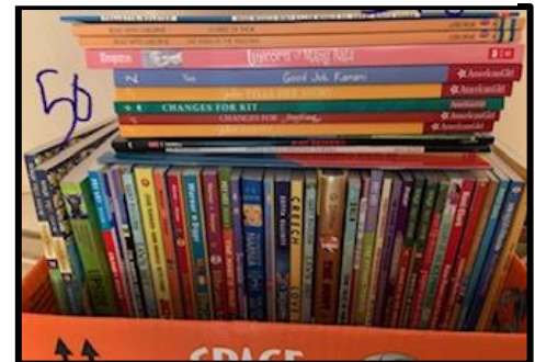
helps Beginning Teachers at every grade level

Crop Walk Fact: There are 144,318 people living at or below the Federal Poverty Level in Mecklenburg County, including 46,259 children.